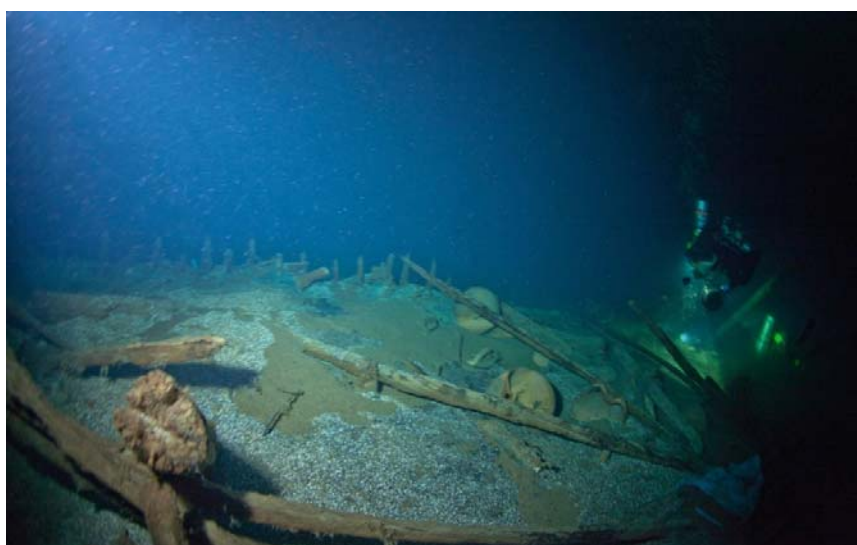
Byzantium shipwreck 2/2 XIII century

In 2004, in conformity with the requirements of the International Convention for the Protection of Underwater Heritage, the Institute of Archaeology of NUAS established the Department of Underwater Heritage of Ukraine - a specialized state-owned enterprise, whose main task is the development of underwater archeology in Ukraine. Scientists of the Department created the first register of underwater cultural heritage of Ukraine, and the map "Monuments of underwater cultural heritage of Ukraine." All known and open objects were put on the state scientific register. All objects of archeology and history in exclusive /marine /economical zone, territorial sea and internal waters of Ukraine were recorded for the first time on the Register and on the map. 2,514 objects were registered. The presence of a gray-hydrogen layer in the Black Sea gives the chance for the discovery of well-preserved monuments even from antiquity in its depths.